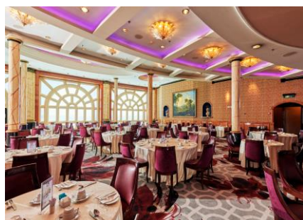
Dream Dining Room

總噸位 75,338 噸 載客 Guests 1,856 人 甲板 Decks 13 層