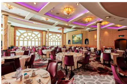
Dream Dining Room

總噸位 75,338 噸 載客 Guests 1,856 人 甲板 Decks 13 層