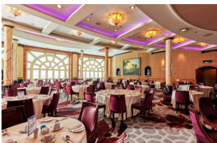
Dream Dining Room

總噸位 75,338 噸 載客 Guests 1,856 人 甲板 Decks 13 層